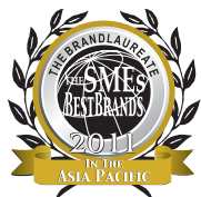
Winner of 2007, 2008, 2009, 2010, 2011, 2012 & 2013 Asia Pacific Brand Laureate Award Best Brand - Laminate Flooring Category

With our head office and well-equipped manufacturing facility in Malaysia; our presence has now expanded to India, Malaysia, Thailand, Vietnam, Singapore, Taiwan, Japan, Indonesia, Cambodia and Australia. Our commitment to deliver quality brings you 18 years of experience with creating complete flooring solutions that will mean as much to you as it does to us.