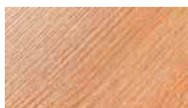
Wood Embossed Surface Finish